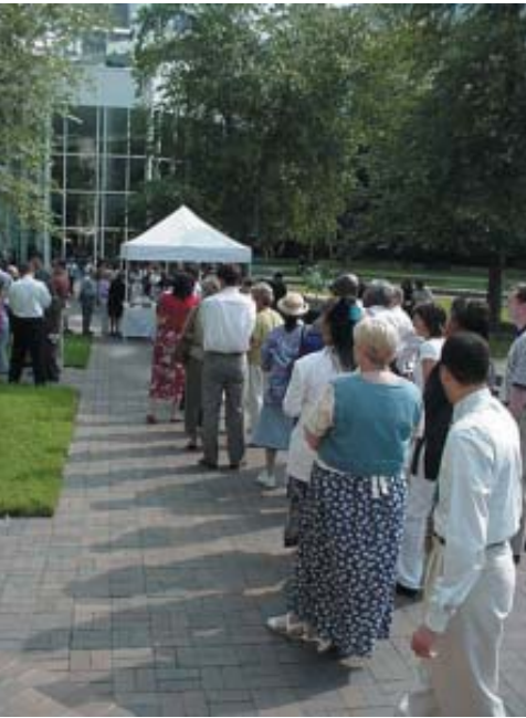
The Ice Cream Social marks the end of Summer at James Center.

Flu Shots will be offered in the Atrium on Monday, November 4 th from 11:00 a.m. to 2:30 p.m. The cost is $15.00, which covers the cost of the serum. It's an easy way to get your flu vaccine without making a trip to the doctor's office.